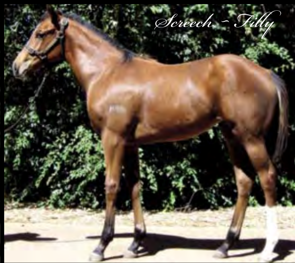
Screech - Filly