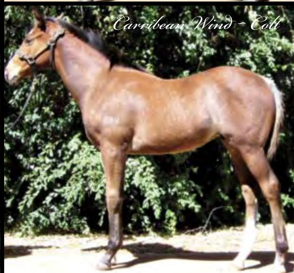
Caribbean Wind - Colt