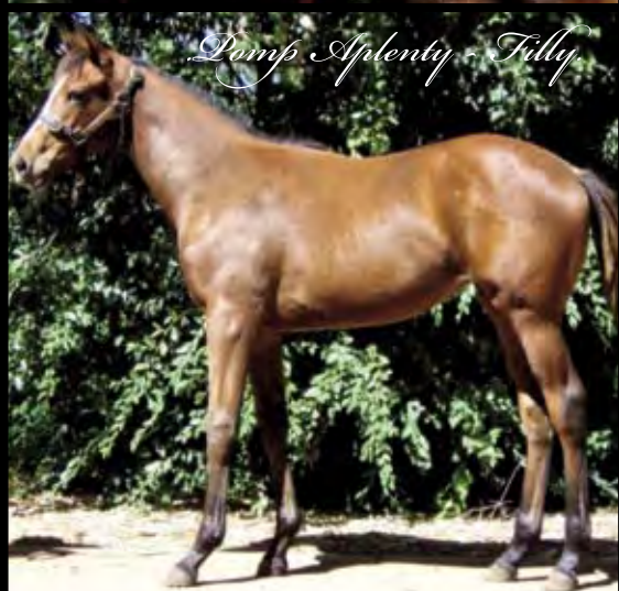
Damp Splenty - Filly