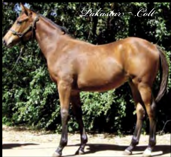
Pakastar - Colt